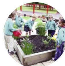
Gosforth Park First