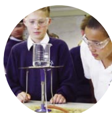
Gosforth East Middle