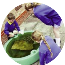
Archbishop Runcie First