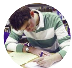
Gosforth High School