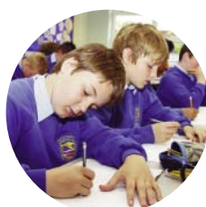
Gosforth Central Middle