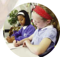
Regent Farm First