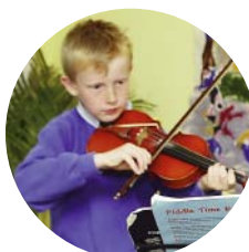
Broadway East First