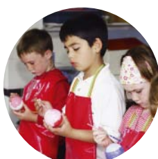
South Gosforth First