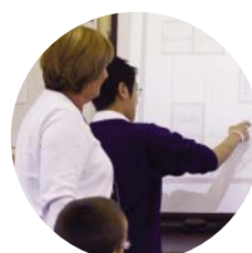
Gosforth Junior High School