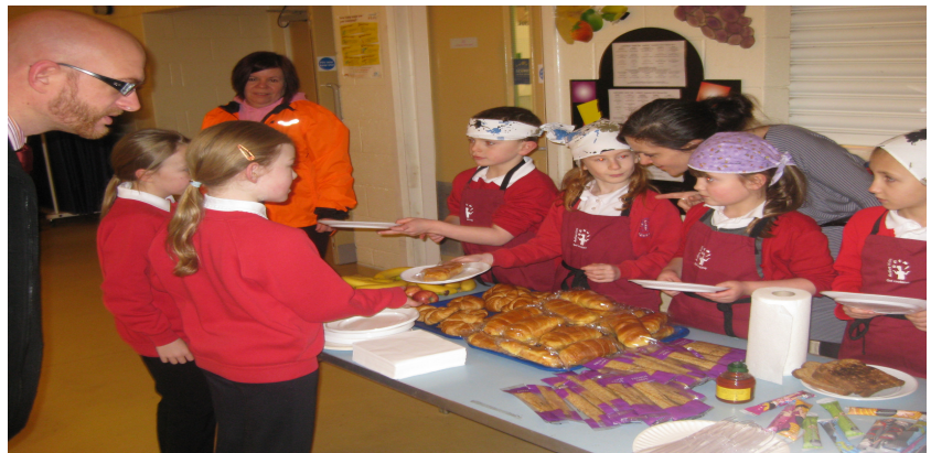
The Let's Get Cooking team hosted our Bike it Big Breakfast.

Year 3 children keep your eyes peeled for the new sessions in the summer term.