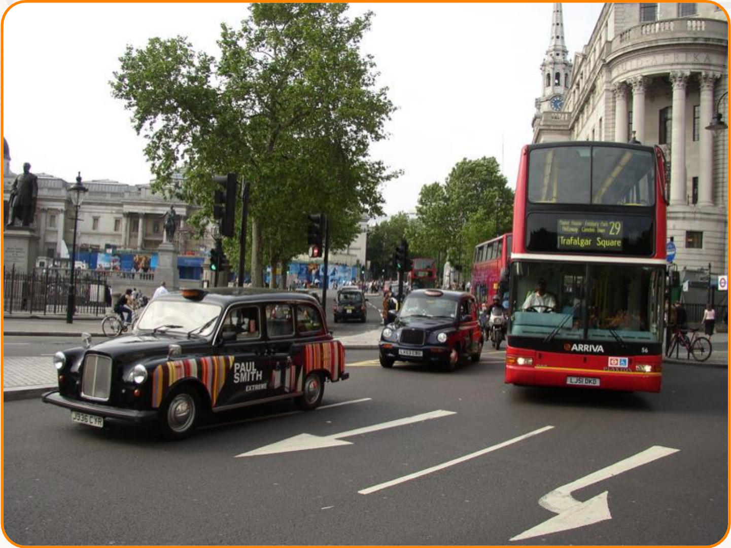
Photo courtesy of Brian Rosner (@flickr.com) - - granted under creative commons licence - attribution