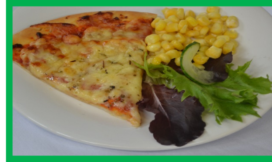
Homemade Cheese & Tomato Pizza