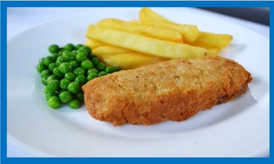
Crispy Coated Fish