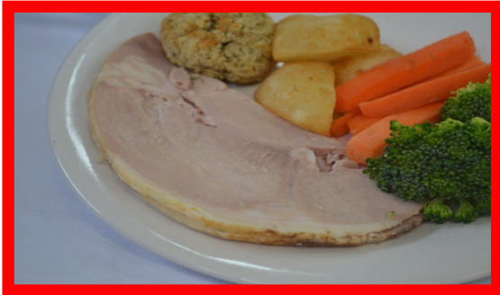
Roast Pork With Sage & Onion Stuffing