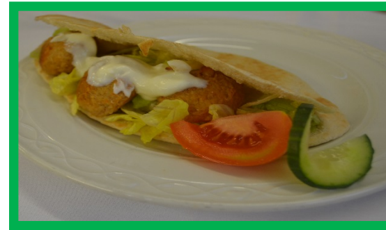
Quorn Kofta in Pitta Pocket