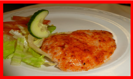
BBQ Chicken Grill