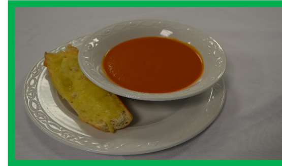
Homemade Tomato Soup