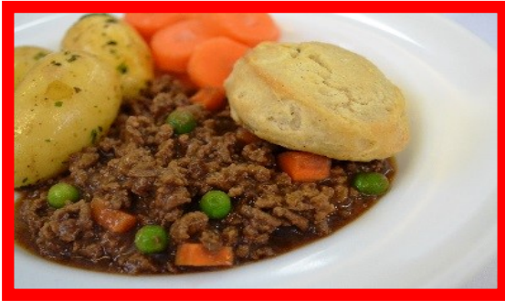
Savoury Mince & Dumpling