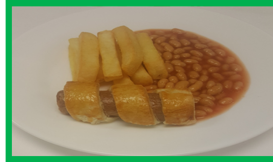
Quorn Sausage Roll