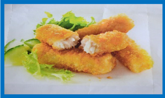
Cod Fish Fingers