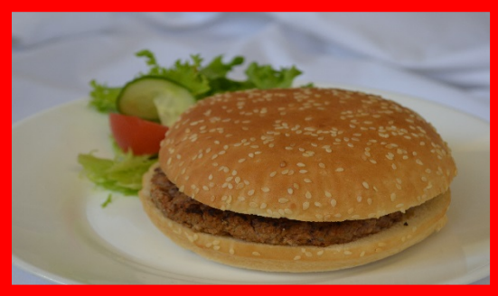
Beef Burger in Bun