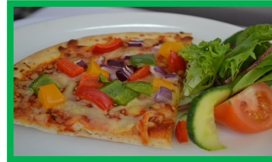
Homemade Roasted Vegetable Pizza