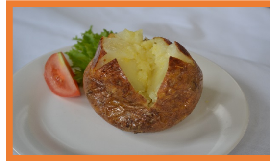
Jacket Potato with Choice of Fillings Cheese, Tuna or Baked Beans