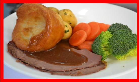
Roast Beef with Yorkshire Pudding