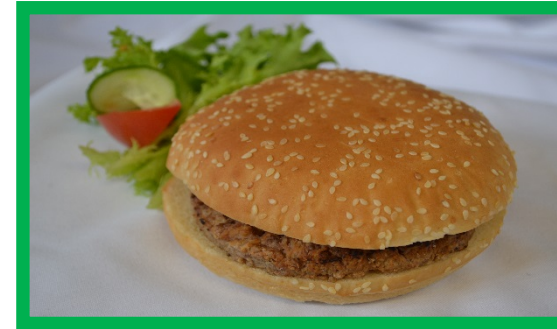
Quorn Burger in Bun

photographs are for illustrative purposes only