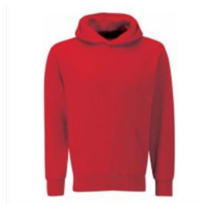
HOODED SWEAT RED (BM)

https://totstoteams.com/archibald-first-school